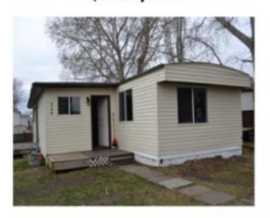
334 Evergreen 3 Bedroom/1 Bath $109,900