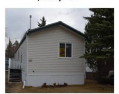
185 Evergreen 3 Bedroom/2 Bath $108,900