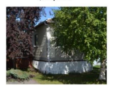
46 Evergreen 2 Bedroom/1 Bath $86,900