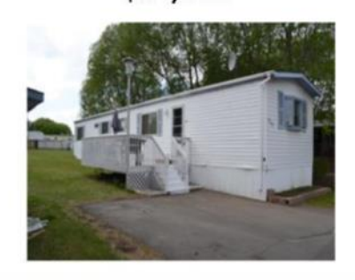
455 Evergreen 3 Bedroom/1 Bath $84,900