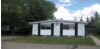
Just Sold 468 Evergreen