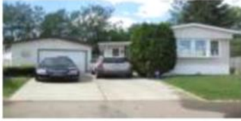
Just Sold 348 Evergreen