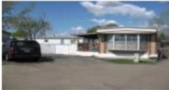
Just Sold 390 Evergreen