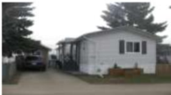
Pending Sale 574 Evergreen