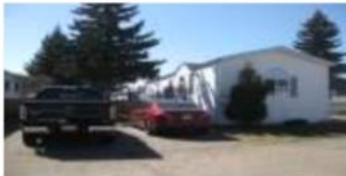
Just Sold 707 Evergreen