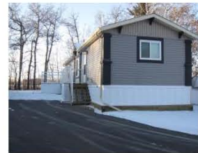
Warranty –Price Reduced $109,900 287 Evergreen