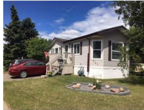
Recently Sold 341 Evergreen

List your home soon to be ready for the spring rush!!